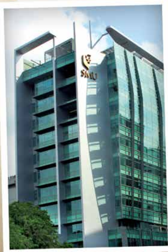
Singapore Management University (SMU) campus